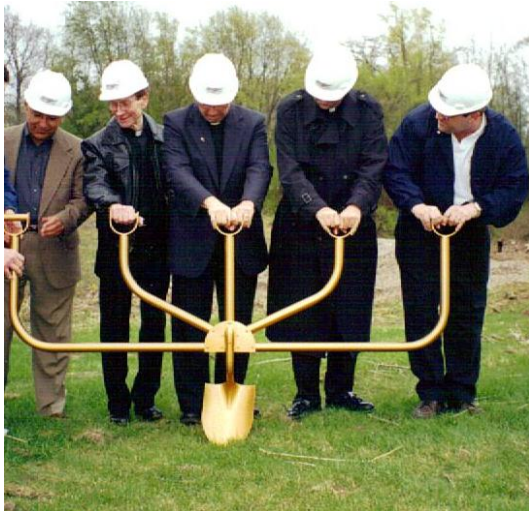
Groundbreaking for the Believers Together Community Center, April 23, 2001.